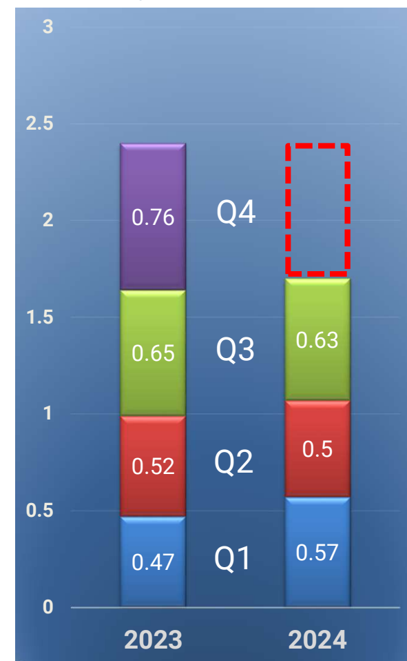
quarterly EPS in 2023 & 2024